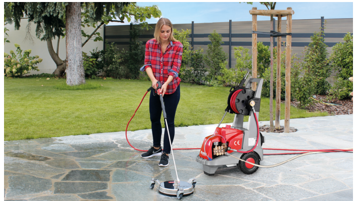
Floor surface cleaner made of stainless steel 300 mm diameter Art-Nr. 394078