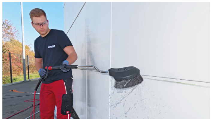
Rotating washing brush for difficult shapes 200 mm diameter, natural hair Art-Nr. 900156