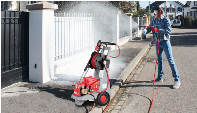
Foam lance with vario nozzle and 2 ltr chemical container Art-Nr. 410702