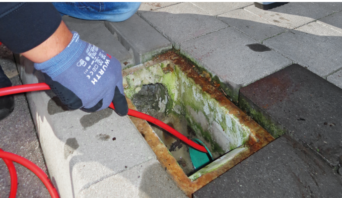
Pipe cleaning hose with spray jet and propulsion 15 m Art-Nr. 911119