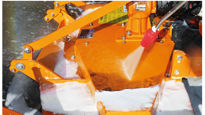
Rotating nozzle with stainless steel jet pipe (included in standard scope of delivery for KD523 Premium) Art-Nr.900181